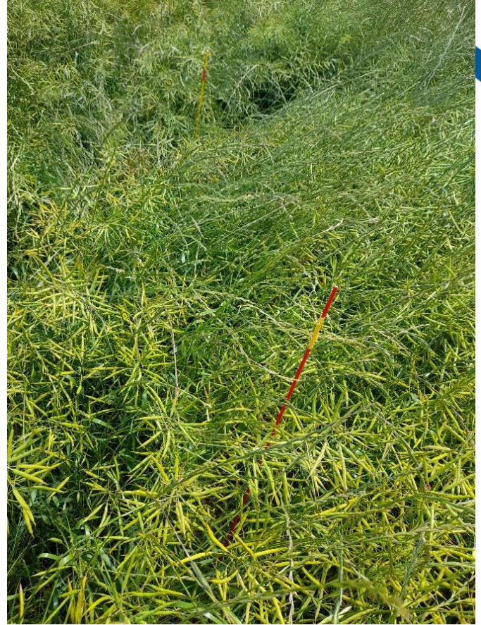
Figure 1 Deer damage and grass weed in treatments