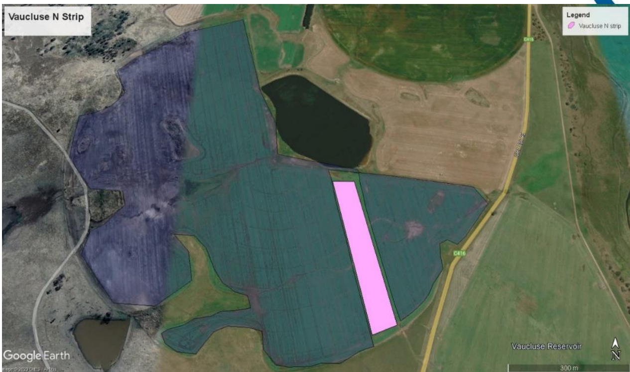
Figure 3 Location of Nitrogen strip in Canola paddock