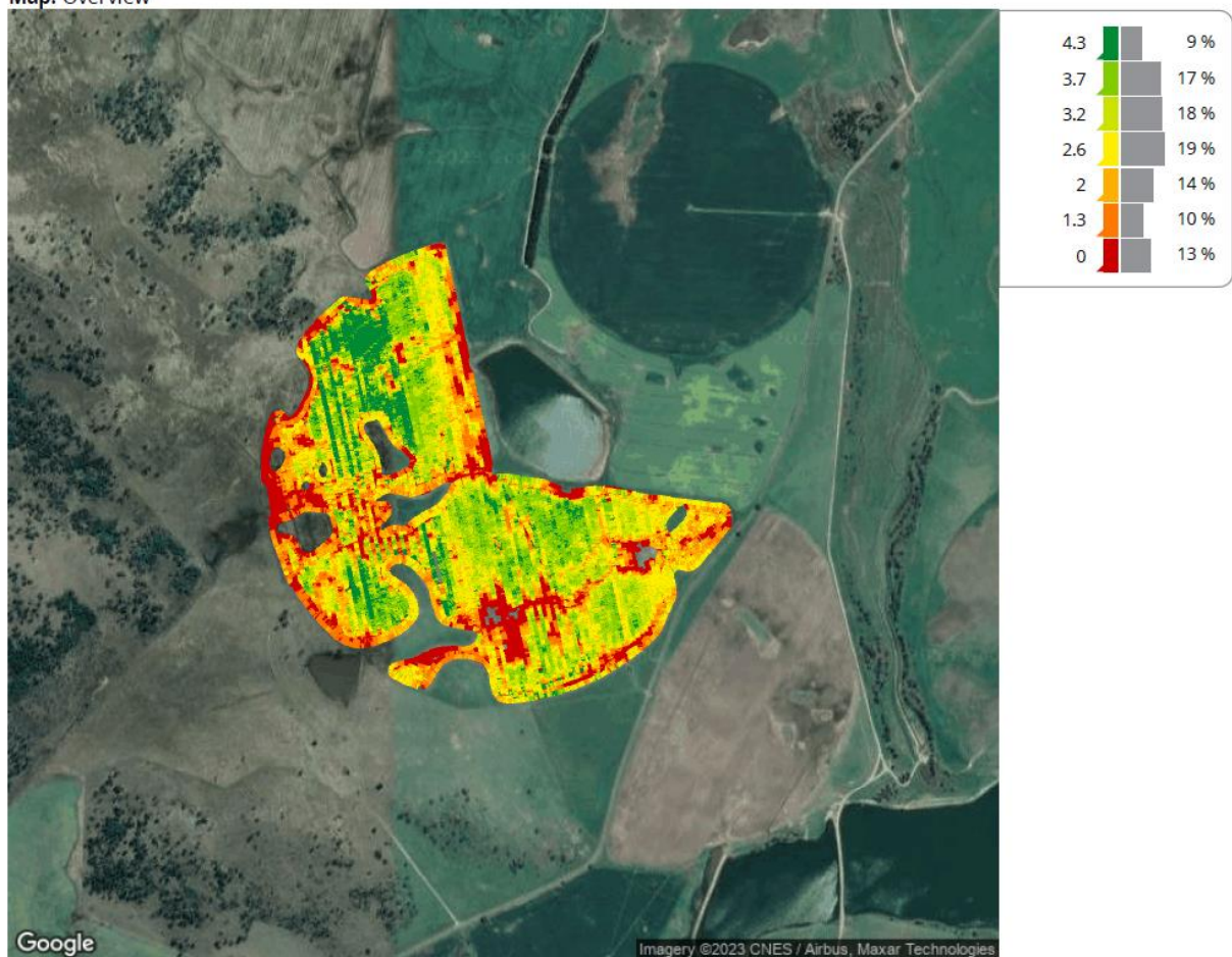
Figure 2 Extract of yield map Silos Canola paddock