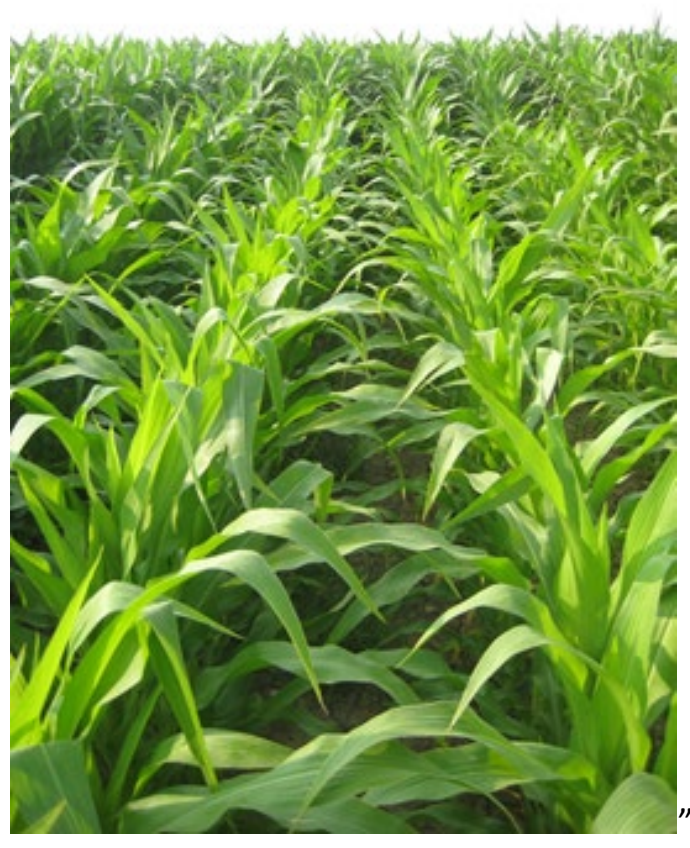
"0N" plot January 7<sup>th</sup>